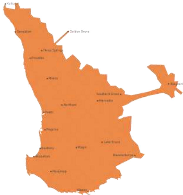
Figure 1 - Map of the Western Power Network

The distribution Network, consisting of over 820 feeders, is connected to the transmission Network at 152 terminal and zone substations and provides an electricity supply to over 1,150,000 customers and over 270,000 streetlights.