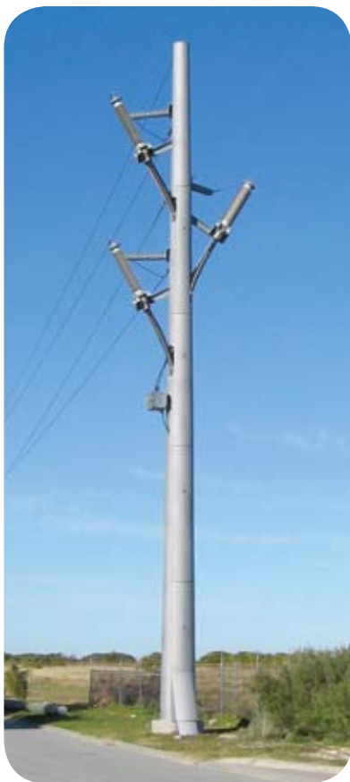
Fig 2. A transition structure in South Fremantle. This is indicative of how the transition structures on Guger Street will look.