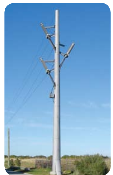
Figure 1: A typical transition pole.

From mid January to mid March Western Power will begin the final phase of the project when the new underground cable is connected to the overhead network. Once the underground cable is connected to the network Western Power will remove the existing designated poles and lines permanently transforming the appearance of Claremont. Western Power managed this work on behalf of the Town of Claremont and the Claremont Joint Venture. Western Power thanks the community for their patience during this work and look forward to working with the Town of Claremont community again in the future.